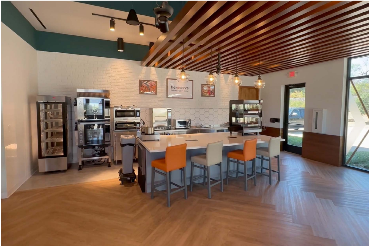
Flexeserve Inc.'s cutting-edge Culinary Support Center – fully equipped with a modern ventless cookline and a large food preparation area for collaborating with customer food development teams