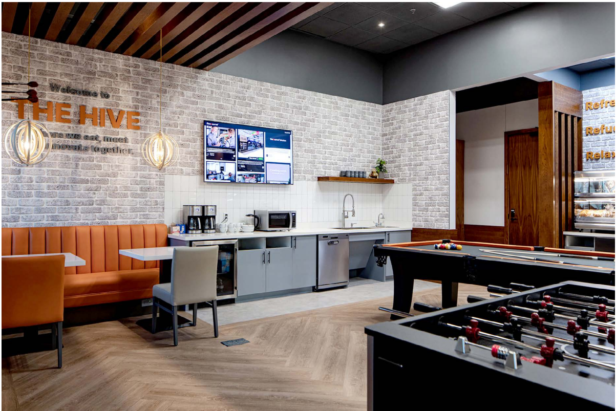
The Hive – where Flexeserve's hot food experts with their customers and rep partners can eat, meet and innovate together

For more information, visit www.flexeserve.com