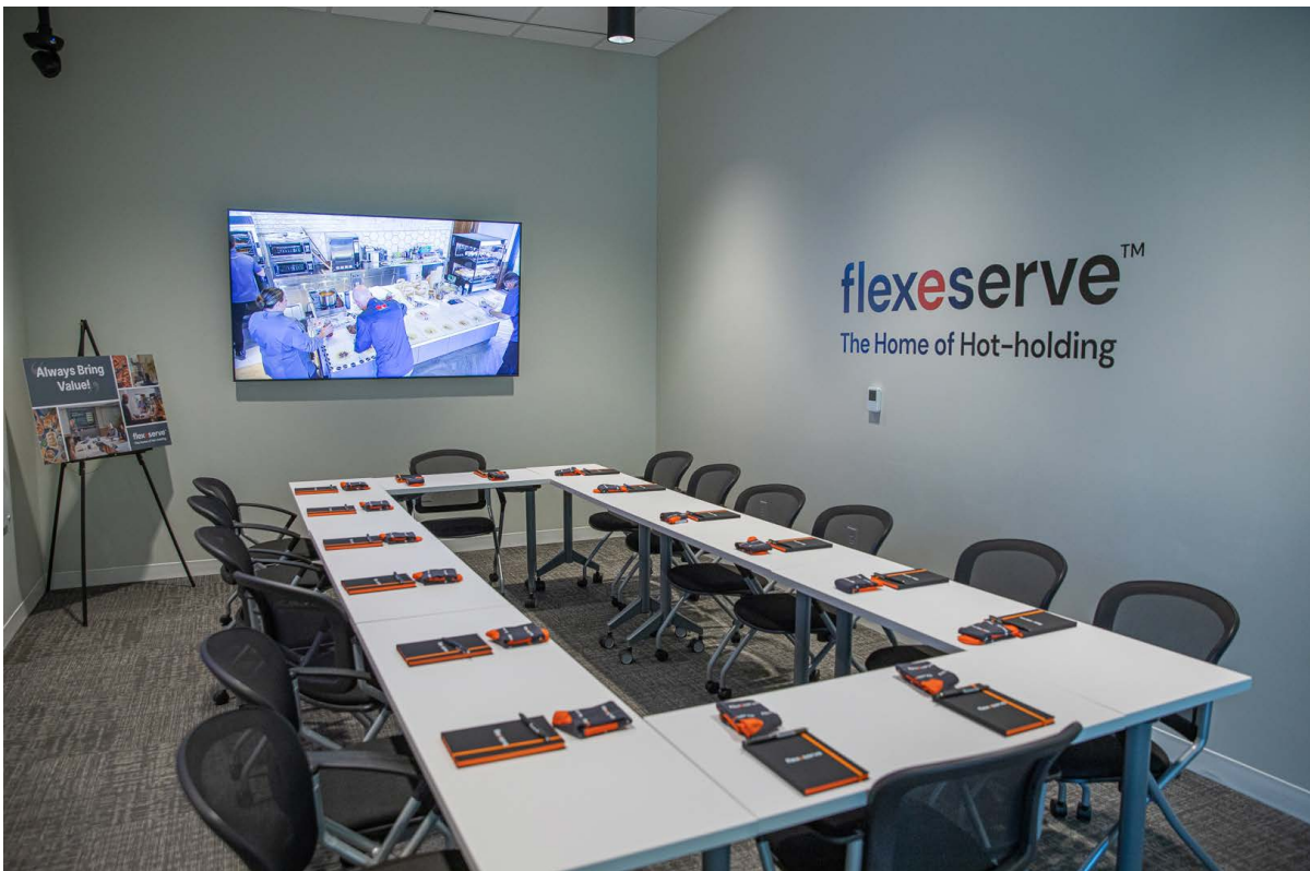
The Studio and Training Room – featuring a direct video link to the Culinary Support Center and installed with the latest digital technologies for customer collaboration and remote demonstrations