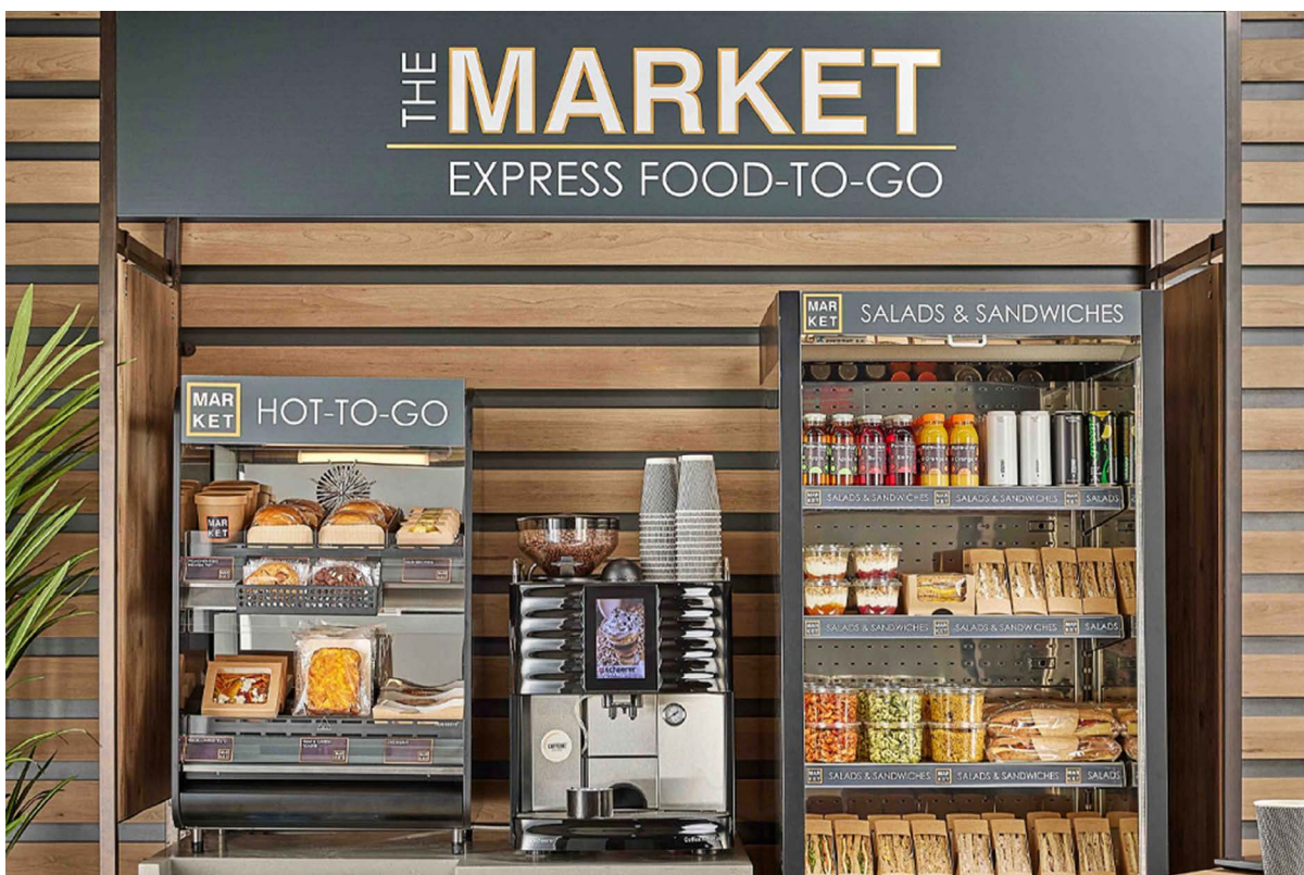
Self-service Micro Market featuring Flexeserve Zone Countertop, with a range of hot grab and go

At Georgia World Congress Center this week in Atlanta, October 4-6, Flexeserve will be showcasing their expertise and brand-new products at Booth C6613 in Exhibit Hall C.