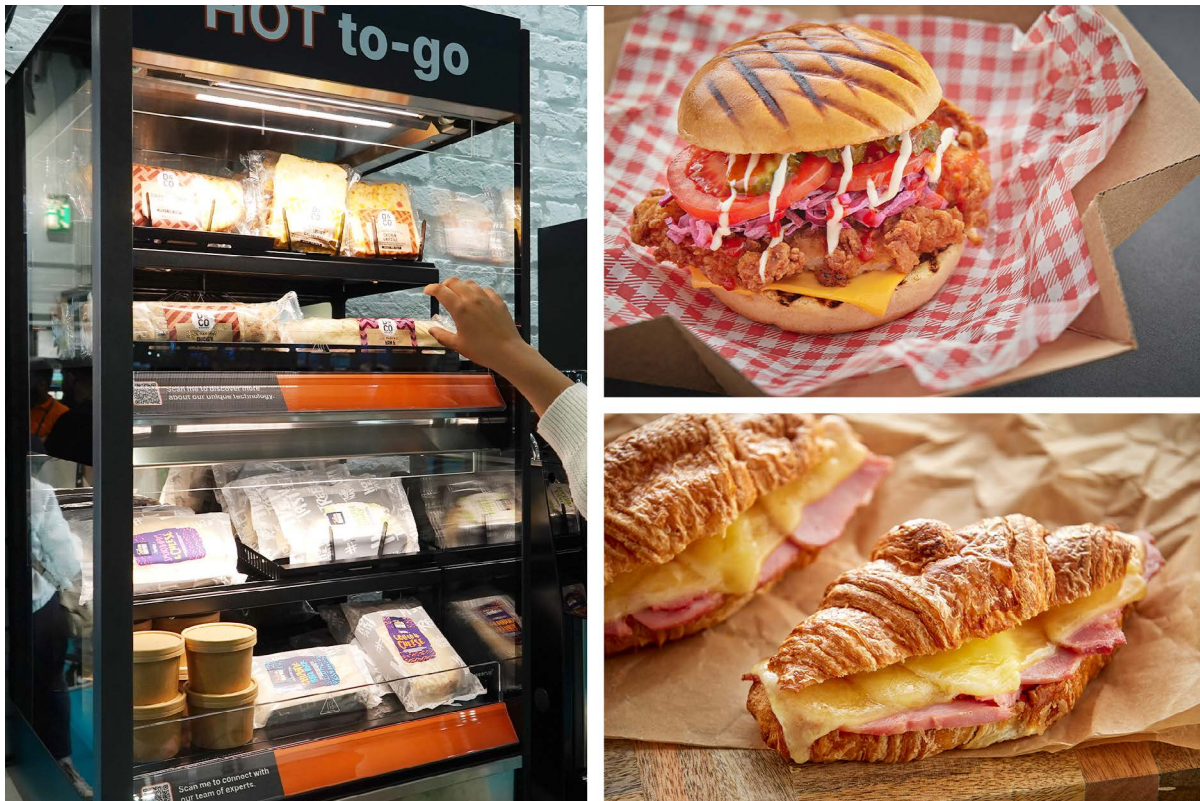
Launching at the NACS Show 2023, the new Flexeserve Zone Xtra with a wide variety of hot food-to-go

Featured in the NACS Cool New Products preview room, the company will be launching its latest heated display – Flexeserve Zone Xtra , which you can vote for at the show.