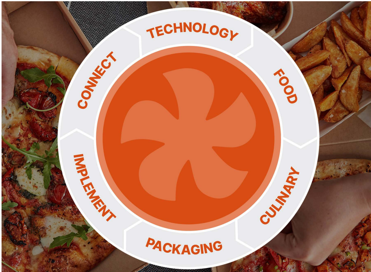
Flexeserve Solution, the industry's only answer to creating an optimized hot food program

Newly evolved for 2023, Flexeserve Solution is now in the U.S. and across the Americas.